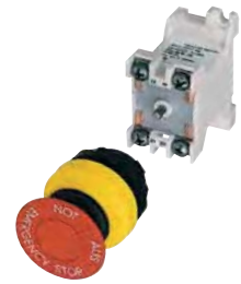
SGTE 1 x 2-pole