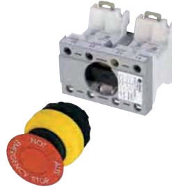
SGTE 1 x 4-pole