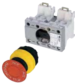
SGTE 1 x 4-pole