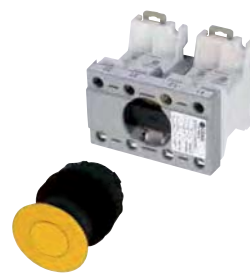
SGT 1 x 4-pole