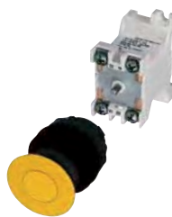
SGT 1 x 2-pole