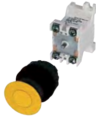
SGT 1 x 2-pole