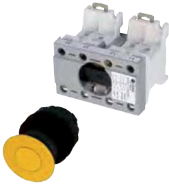
SGT 1 x 4-pole