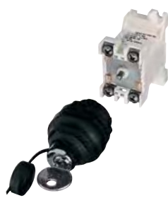
SLT 1 x 2-pole