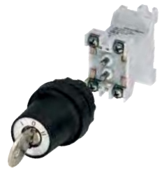
SLS 1 x 2-pole