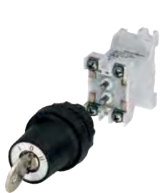
SLS 1 x 2-pole