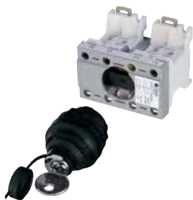
SLT 1 x 4-pole