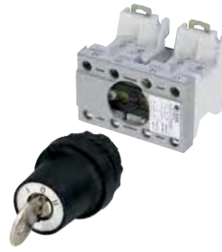
SLS 1 x 4-pole