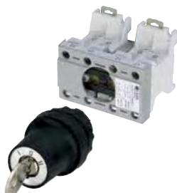
SLS 1 x 4-pole